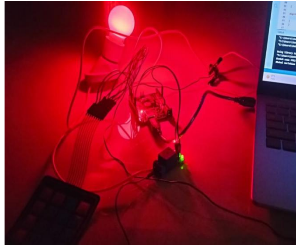
Figure 3: Result Of PBCBELS